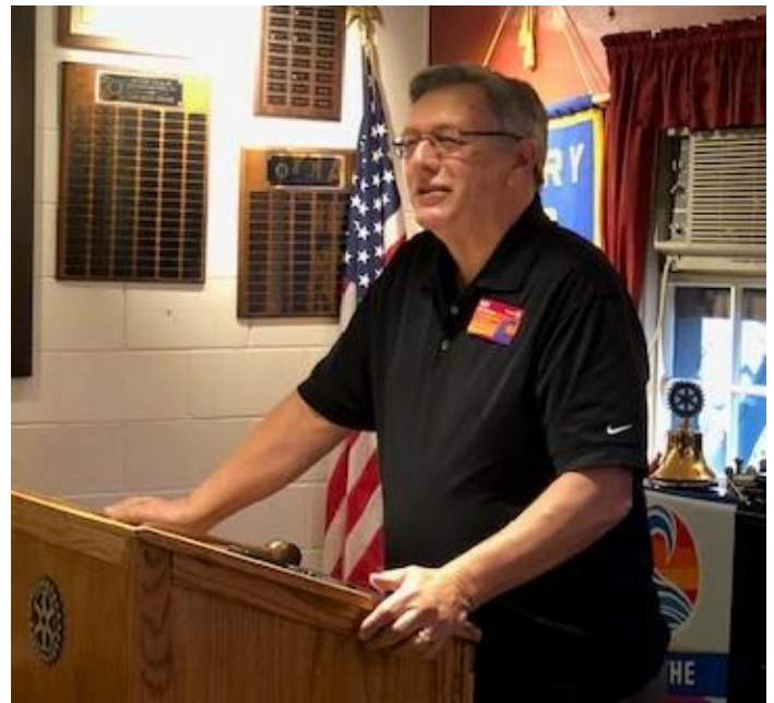
ART JOINED ROTARY SAN JUAN BAUTISTA ON FEBURARY 3, 2011.